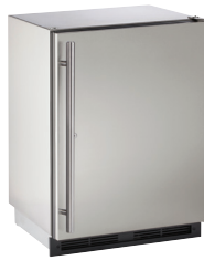
STAINLESS SOLID (LOCK)